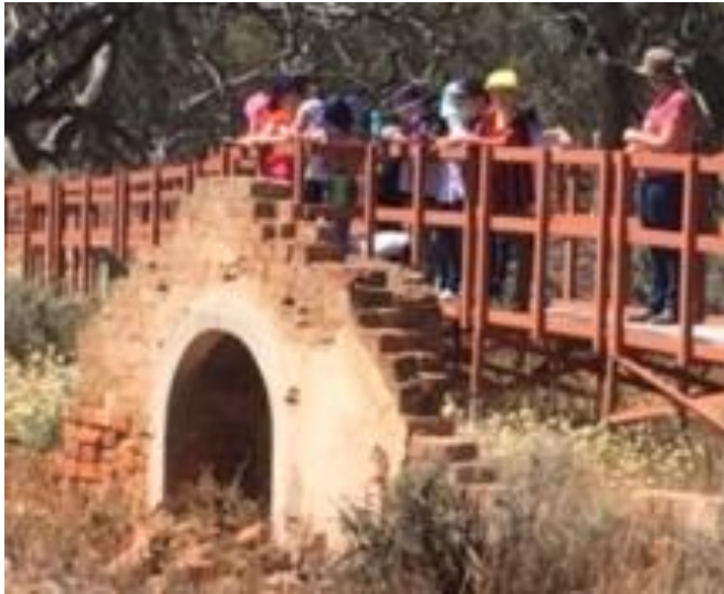
(REMAINS OF THE OLD HOMESTEAD)

and Different'. Students were taken on a journey of discovery where our first point of call was the Old Homestead. Students learnt that the homestead was positioned where it was because of several factors, which included accessibility to the river and the possibility of flood ruining the homestead. Students also discovered that the bricks were originally made by hand and as time went by new sections were added to the homestead and bricks were brought to the homestead by barges that travelled along the Darling River.