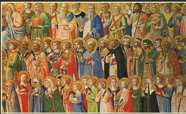
All You Holy Saints of God, Pray for Us!

I, John, looked and there was an enormous crowd, impossible to count! The people were from every race, tribe, nation and language, and they stood before the throne of the Lamb, dressed in white robes and holding palms. One of the elders asked me, "Do you know these people dressed in white and where they come from?" Then he said, "They are the people who have come safely through the terrible persecution and they have washed their robes white with the blood of the Lamb.